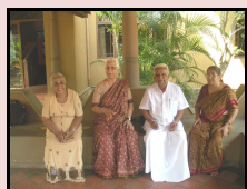
Meeting with Dr. and Mrs. Aryaratnam, founder of Sarvodaya movement