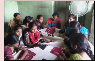
Women at patch work training