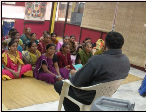
Members of Saundarya Cleaning Co-op. in a training session