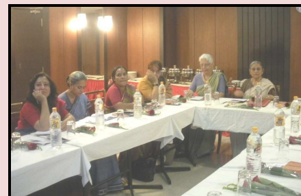
Meeting on 'SEWA Heritage Haveli Project' at Kanak Hotel on 24 th Jan., 2011.

The objective of the workshop was to assess aesthetic damage and need for restoration of the building and develop it as 'Live Craft Museum' to preserve the heritage values and characteristics, restoring the bonds of artisans between traditional buildings crafts and SEWA's activities in the 600 th anniversary year of Ahmedabad city.