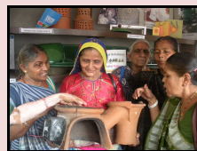
Some of BoDs look at simple technologies, introduced by Practical Actions